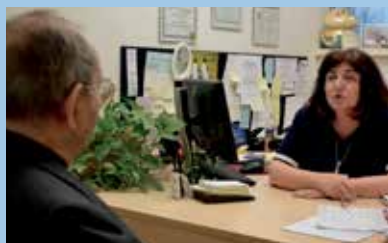
JFS Expanding Support for Holocaust Survivors