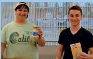
Help Families in Need Observe Passover