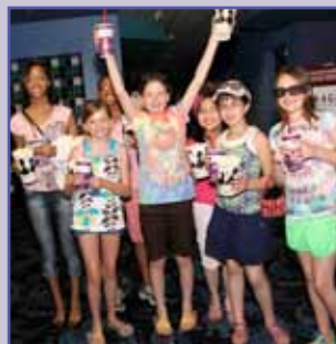
Over 220 community members participated in the event